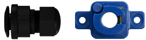
Gland Nut (left) or °C Clamp (right) fitment options available